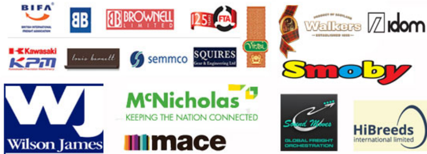
Manufacturers, construction, exporters & others