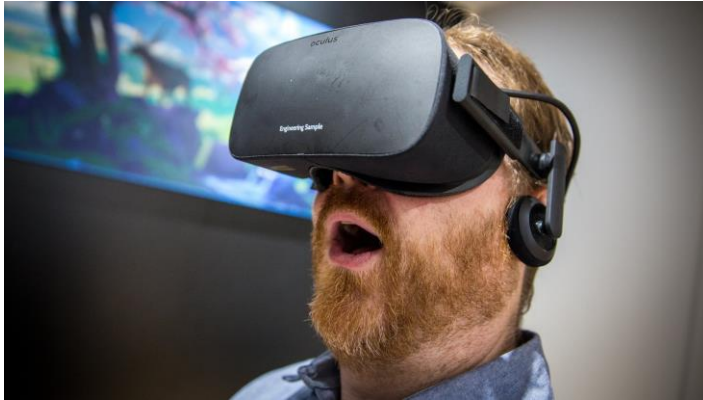
Virtual Reality (VR)