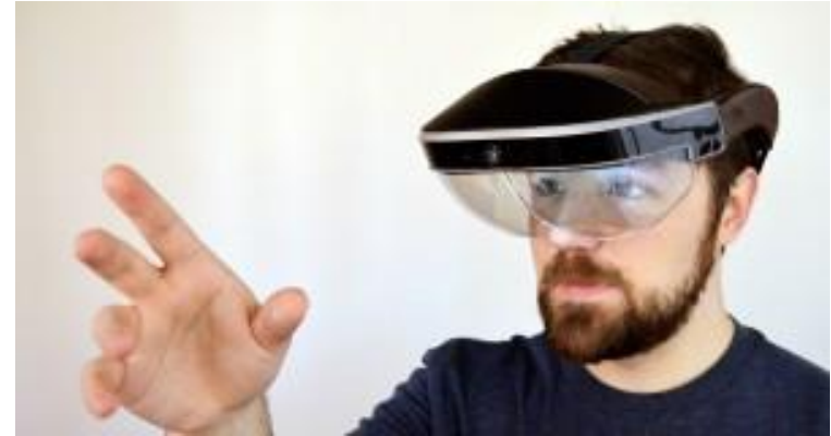
Augmented Reality (AR)