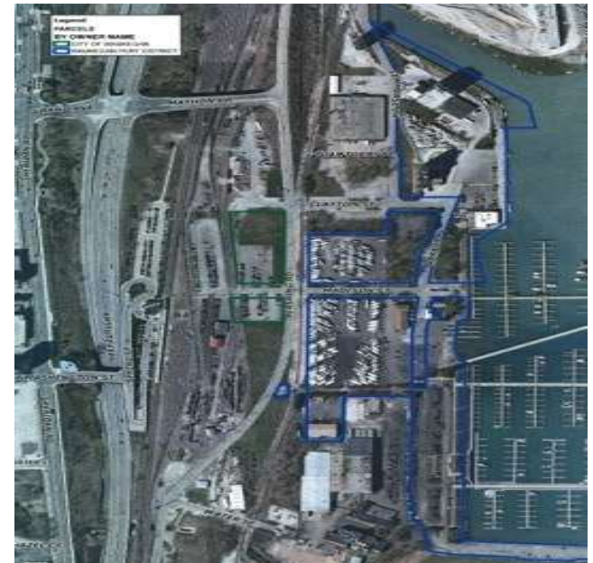
Waukegan, IL: Commuter rail station