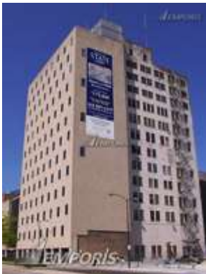
Former CPD Headquarters