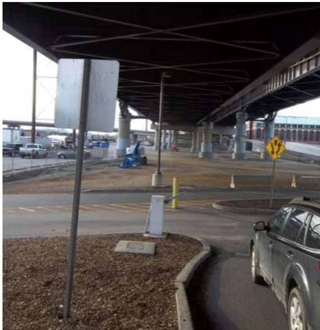
St. Louis, MO: Departing the (relatively) new Amtrak Station